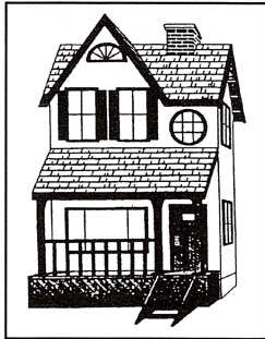
Equal Housing Opportunity