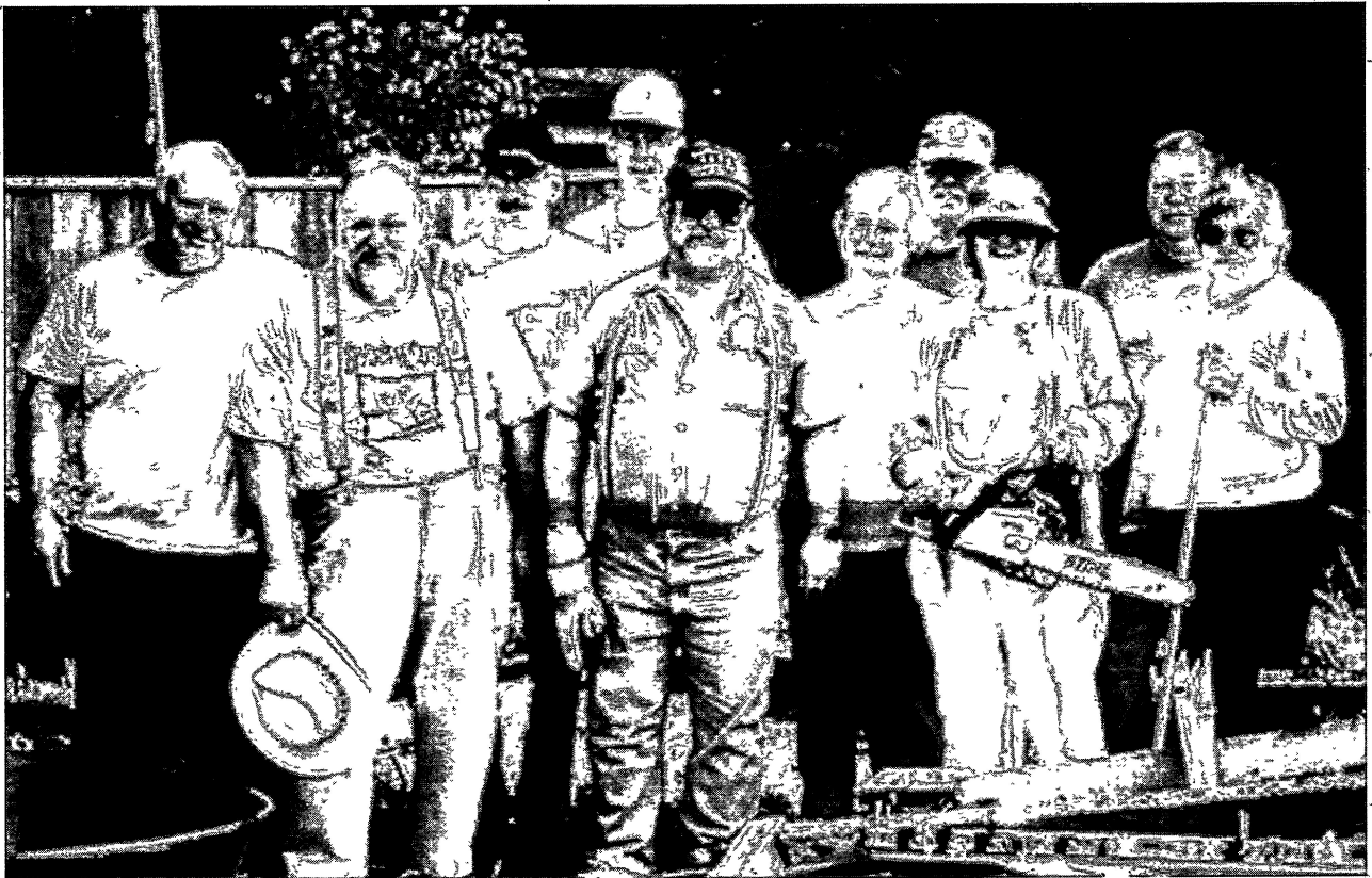
Volunteers at a Homes First! workparty

Creating Affordable Housing in Thurston County