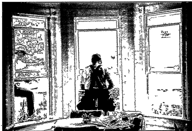
Workers install energy efficient windows in one of our homes.

In the year 2000, Homes First provided safe, decent, affordable housing to 63 local households. Those households included 66 adults and 45 children, for a total of 111 people. The average income of the households was 30% of the area median income. That equals a gross annual income of $14,950 for a family of 4, or $10,500 for an individual.